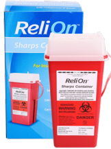
ReliOn™ Sharps Container $2.84