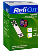
ReliOn™ PRIME Test Strips 25 ct $5.00 50 ct $9.00 100 ct $17.88