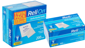
ReliOn™ Alcohol Swabs • 100 ct Swabs $1.08 • 400 ct Swabs $3.82