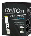
ReliOn™ Platinum Test Strips 50 ct $10.28 100 ct $17.98