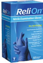
ReliOn™ Nitrile Examination Gloves (50 ct) $9.97