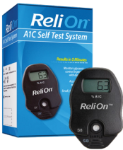
ReliOn™ A1C Self Test System $34.88